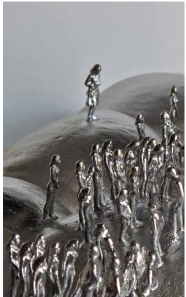
Kambiz Sabri, sans titre, 2010, détail