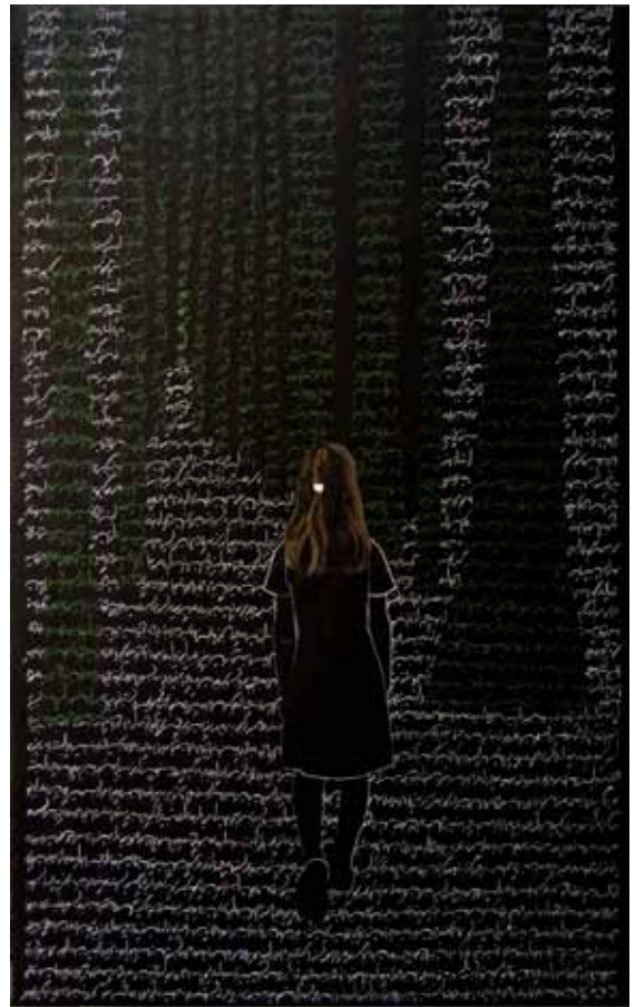
Katâyoun Rouhi, Où est la demeure de l'ami, 2010, 81 x 130 cm

one to say a lot of things", says the artist. The figure of the child, a melange of the artist's daughter and herself as a child, is shown from the back, allowing one to identify oneself with her. In this way she becomes a generic, timeless figure. The tree itself also symbolizes the quest for identity. Is it the Tree of Life, the Tree of Knowledge, a Family Tree, the Cosmic Tree? "Everyone can see what they wish. But in Persian poetry, it is a point of reference. During my childhood we oriented ourselves in the wild by the trees that punctuated the landscape." The classical style of her paintings confronts a surrealistic representation. The artist paints her